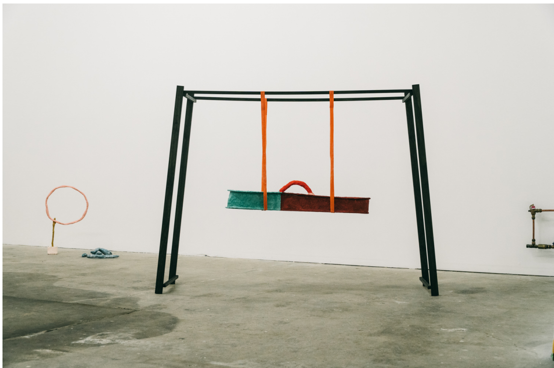
Hailey Atkins, What's Good For You (Installation Detail), 2018