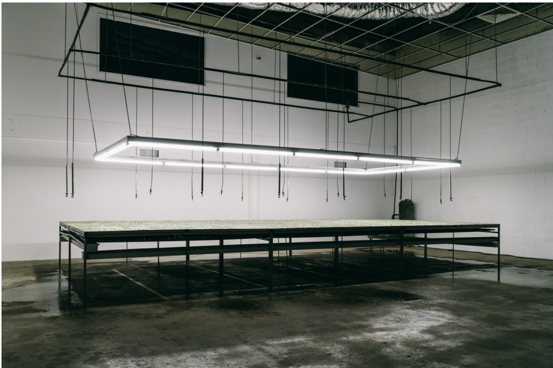
Anya Swan, Scrub , 2019