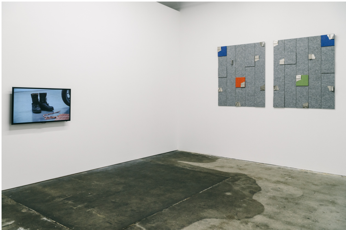
Tim Woodward, Silent Aspiration (Installation Detail) 2019

Outer Space reserves the right to terminate any exhibition should applicants be in breach of this agreement or unable to meet the expectations of the program